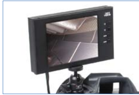
External SVGA LCD monitor