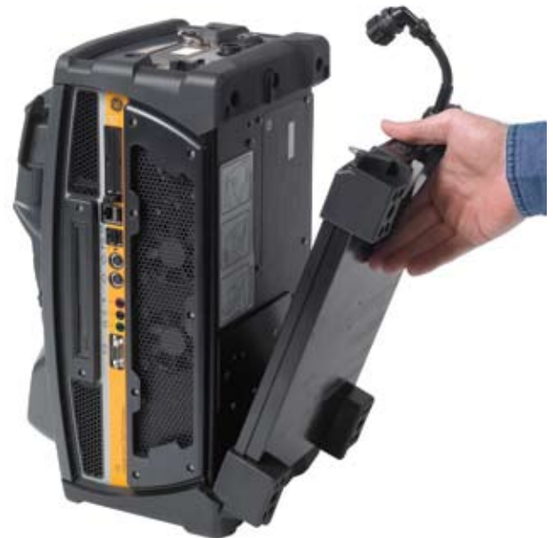
System with integrated battery