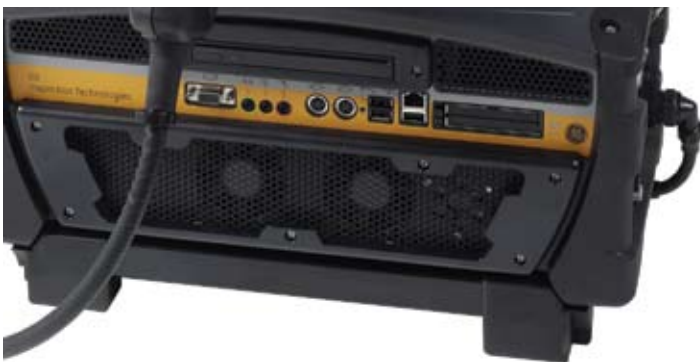
One- or two-hour capacity battery/UPS facilitates confined space work.