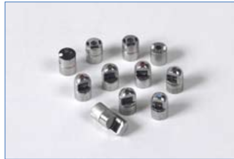
Full range of optical tips including stereo and shadow measurement with a NIST traceable verification block