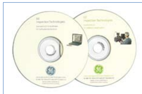
Application software (Menu Directed Inspections and Report Generators)