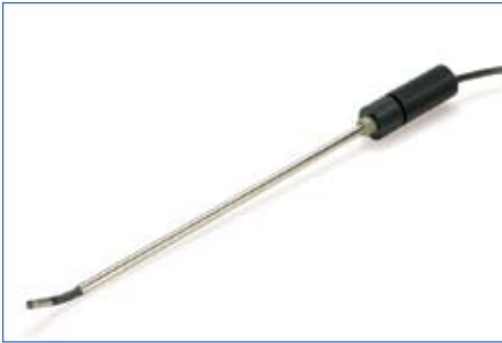
Rigidizers and Grippers