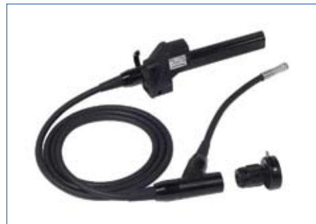
Borescope adapter for rigid and flexible borescopes and high-magnification lenses