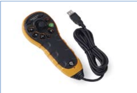
Wired remote control with joystick