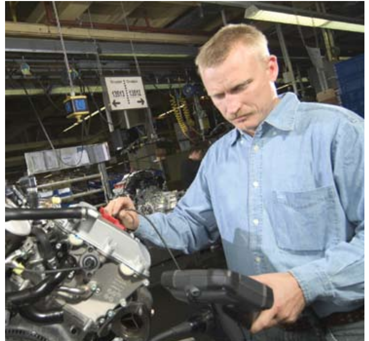
Inspect valve seating through the spark plug port

R&D labs can leverage the tool's enhanced imagery and high-output lighting to generate clear, visual pictures of component fit in new auto designs. With improved lenses, digital-signal processing and an extra-bright, high-resolution, VGA LCD screen, the Everest XLG3 system delivers bright, distinct inspection images for faster defect identification. And for inspection locations that lack power, the system runs up to two hours from an integrated battery pack and uninterrupted power supply.