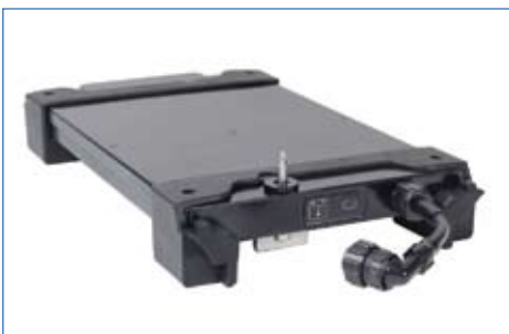
One- or two-hour capacity battery/UPS (uninterruptible power supply)