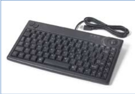
USB keyboard with trackball