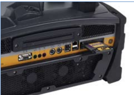
Two PC card slots for expanded memory cards