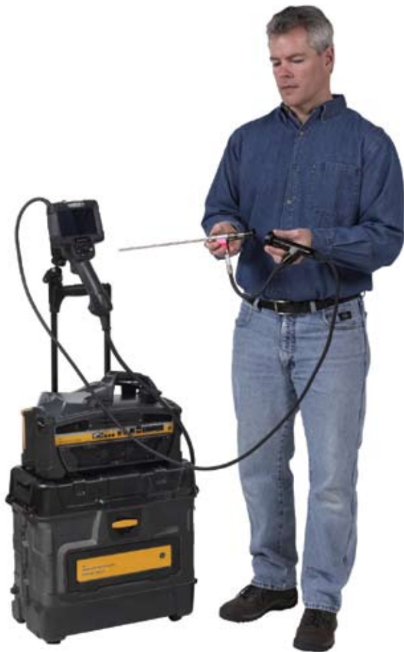
Borescope adapter to integrate user's current rigid and flexible borescope.

The Everest XLG3 system features interchangeable QuickChange™ probes that quickly reconfigure to meet aircraft maintenance manual requirements for probe diameter and length.