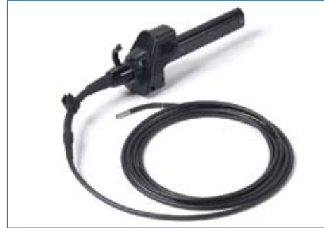
QuickChange™ spare probes in 3.9 mm, 6.1 mm, 6.2 mm with working channel* and 8.4 mm diameters in lengths of 2, 3, 6 and 8, and 9.6 meters